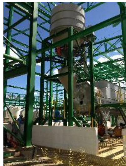
Mining processing structures – South America