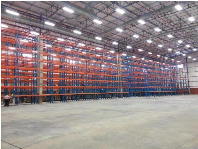
Pharmaceuticals warehouse, Johannesburg