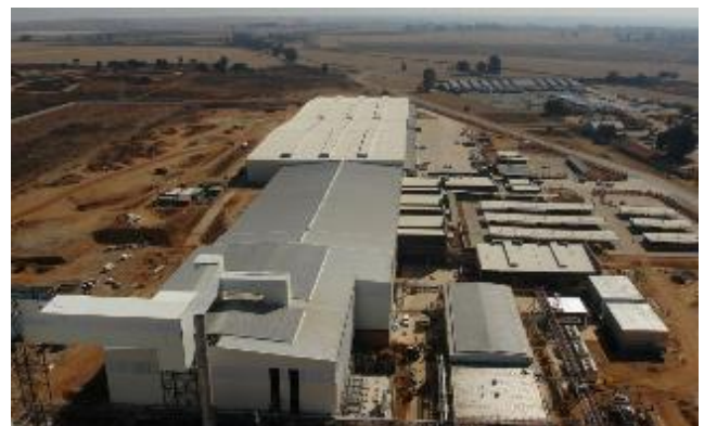
Consol Nigel Furnace Building & Warehouse