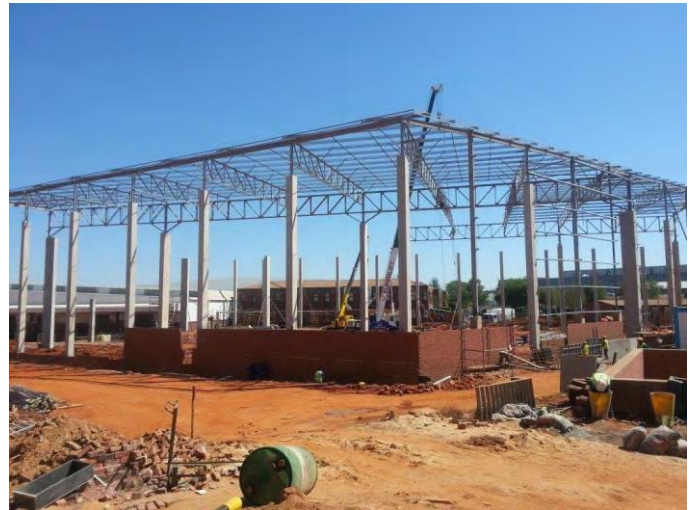
Pharmaceuticals warehouse, Johannesburg