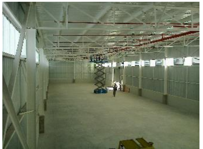
Storage building, Johannesburg