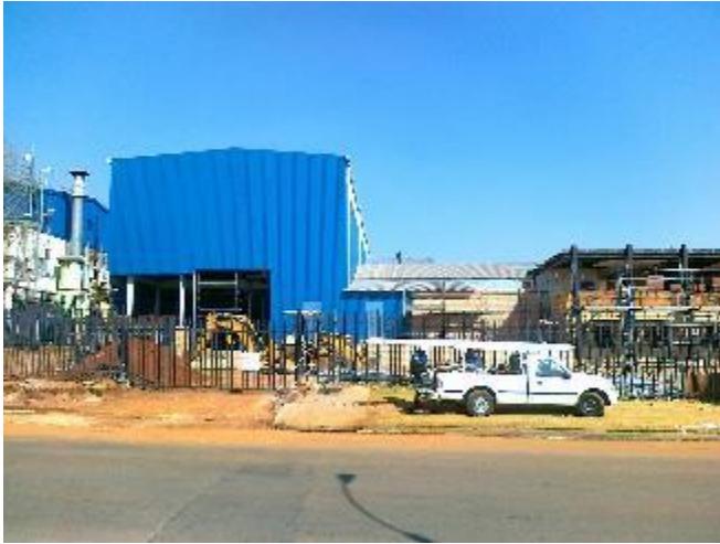
Manufacturing facility, Johannesburg