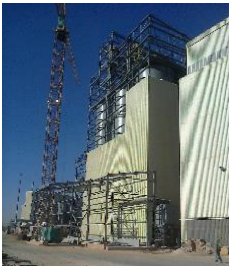
Batch Plant, Johannesburg