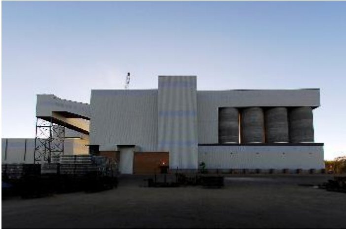
Consol Nigel Batch Plant on completion