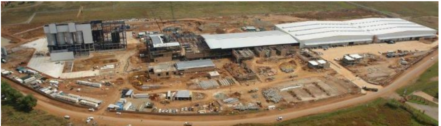
Consol Nigel site during construction