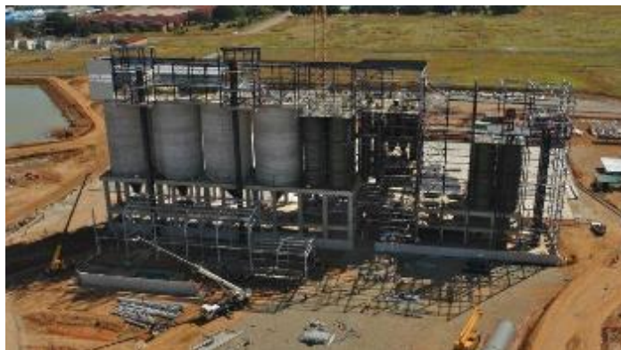
Consol Nigel Batch Plant