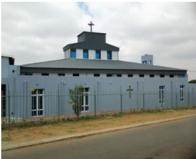
Church - Soweto