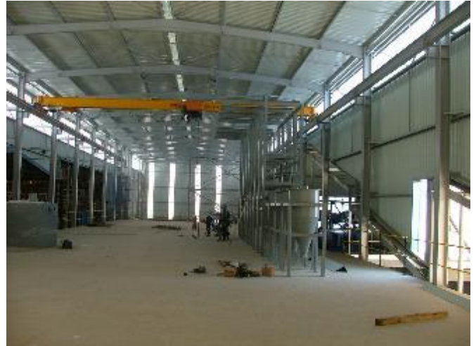
Manufacturing facility, Johannesburg