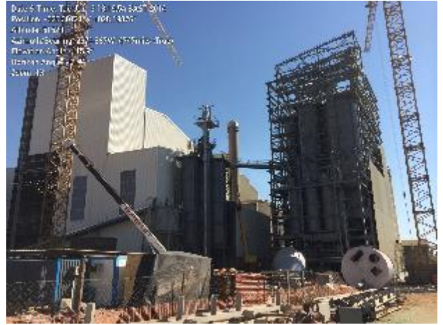
Batch Plant, Johannesburg